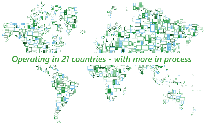
Operating in 21 countries - with more in process

The R2 Program supports responsible and legal trade partnerships that promote reuse, training and technology sharing. As safer recycling methods are shared and adopted around the world, both workers and the environment benefit. R2 is also bridging the digital divide by making affordable, used electronics accessible to more people.